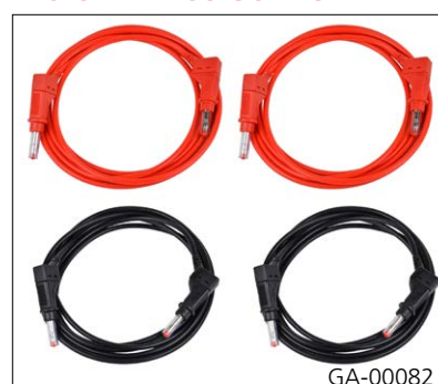
Test lead set, 4 x 2 m (6.5 ft)